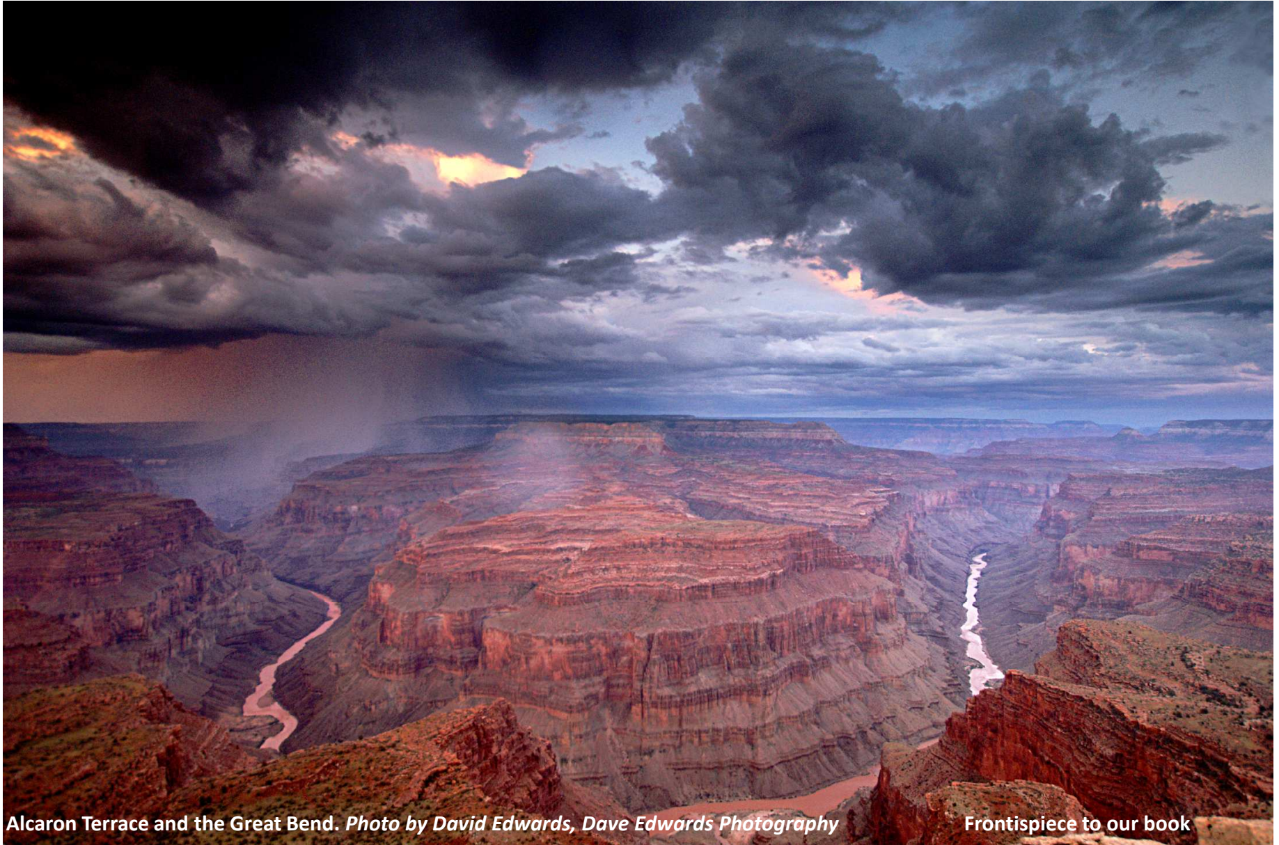
Alcaron Terrace and the Great Bend.