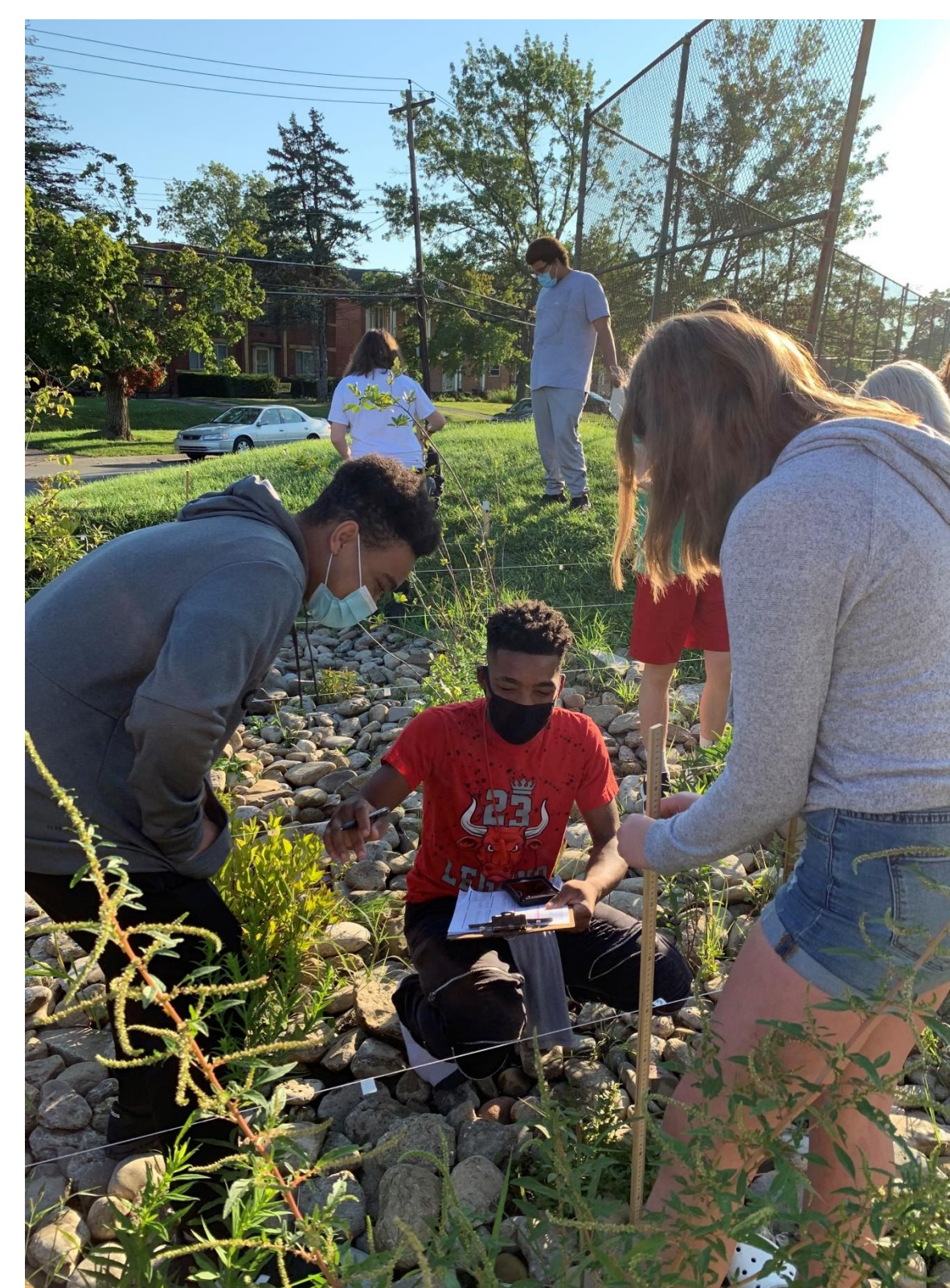
Fig. 3 Students surveying the rain garden. Measurements were taken from the ground up to the string that was at a consistent height across the rain garden.