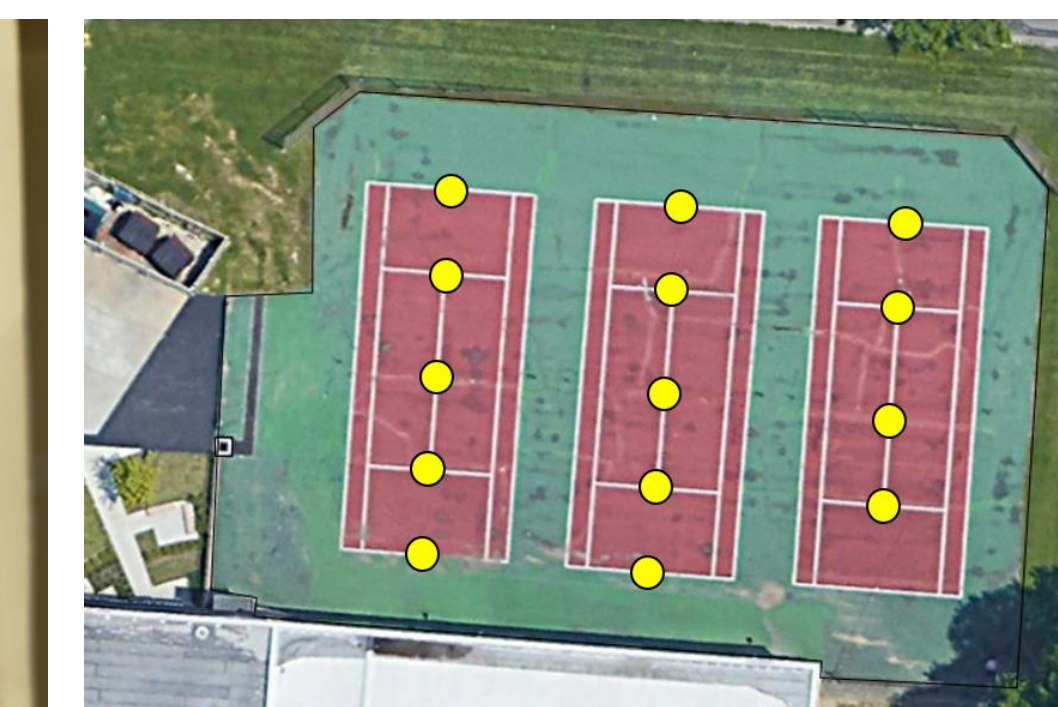
Fig. 7 Deployment map of the soda bottle rain gauges on the tennis courts near the DPHS rain garden.