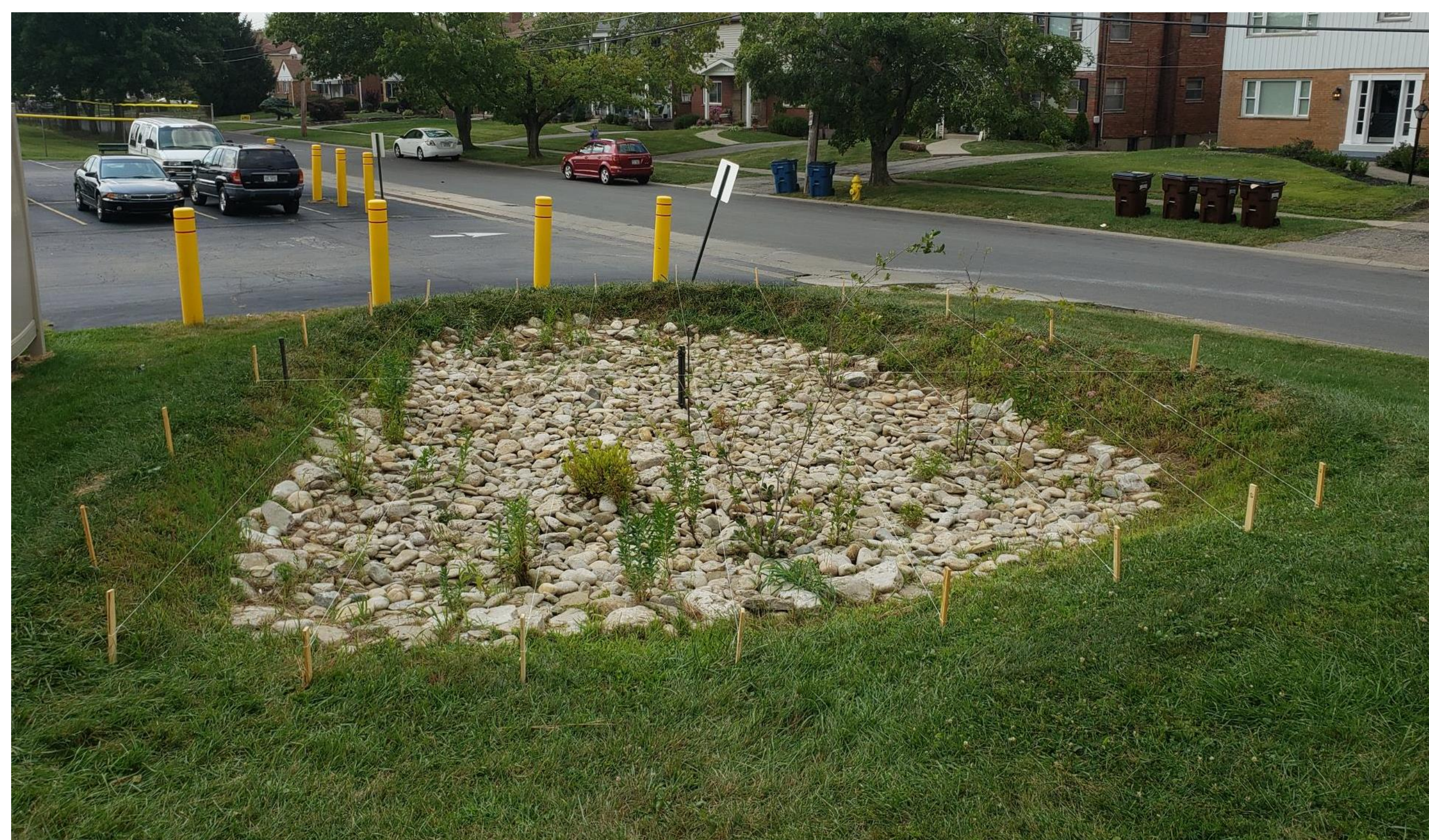
Fig. 1 The Deer Park High School rain garden. Stakes were placed around the perimeter and across the rain garden to create 8 transects. White string was attached to the transect stakes so the string remained at a common elevation from which students could measure.

This initial effort laid the foundation to develop additional physical science curriculum materials linked to the rain garden including hydrogeologic skills such as analysis of staff gauge data, rain gauge data, and soil percolation tests.