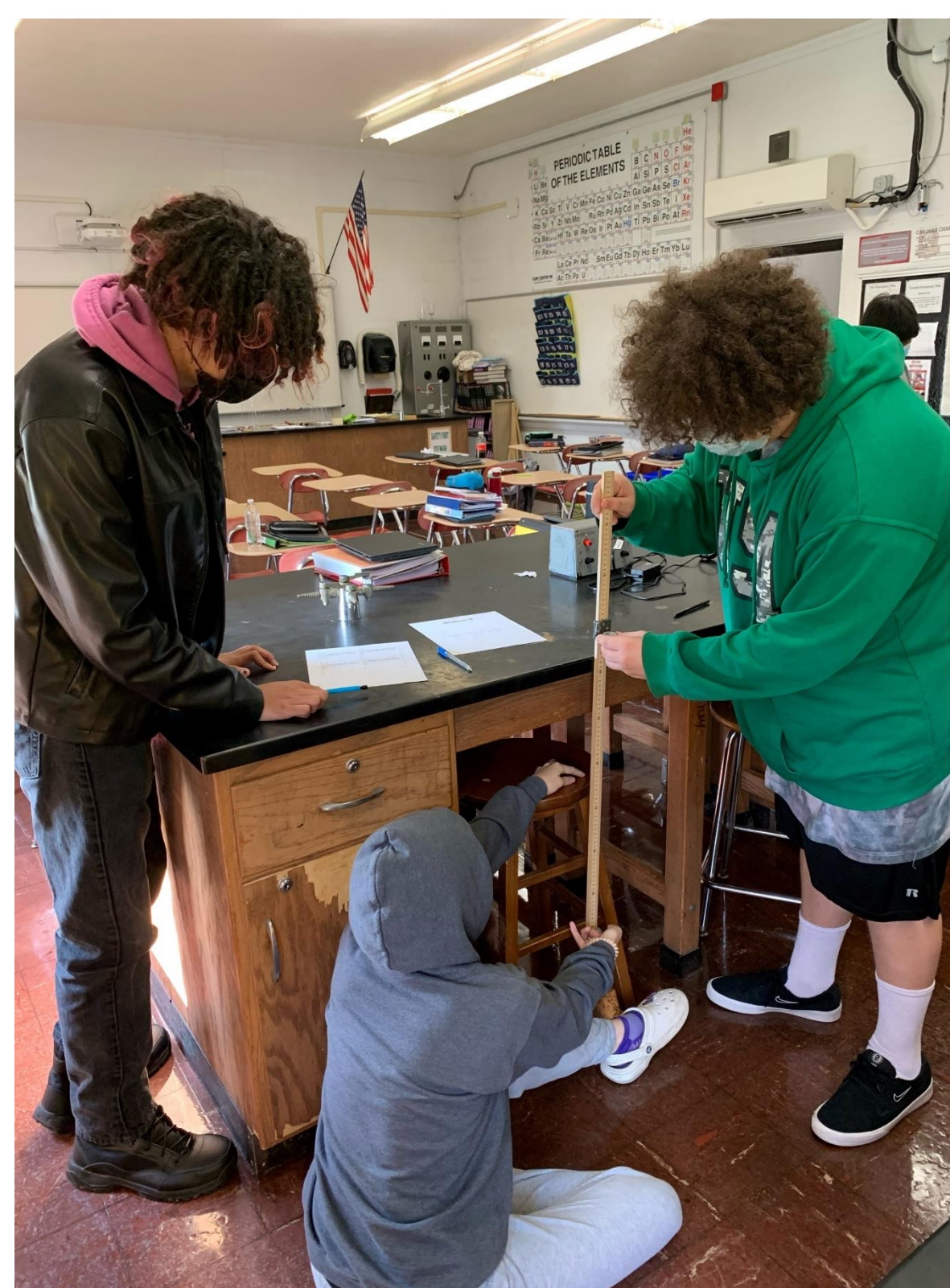
Fig. 2 Students practicing the modified surveying procedure using meter sticks and bubble levels.

The students were tasked with determining how much water the rain garden could capture and divert from nearby storm drains. They were introduced to surveying and practiced a modified surveying method in the classroom using metersticks and bubble levels. The next day the classes conducted an elevation survey for a reference grid established within the rain garden.